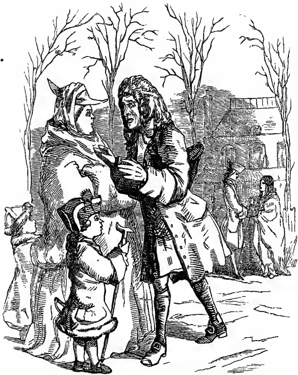
A Young Reprobate.